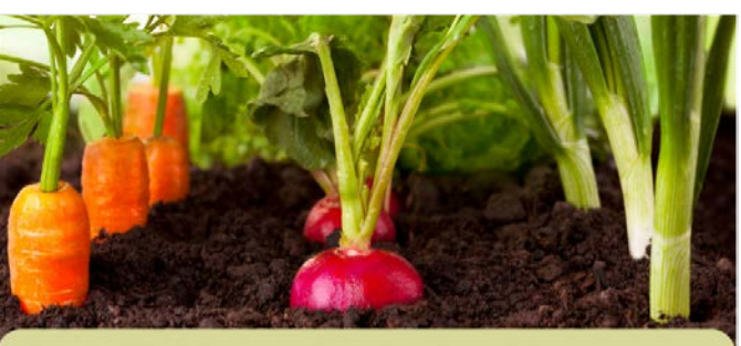
SEEDY SATURDAY (All ages) Saturday, March 8 11am-3pm

Feeling nostalgic about the games from your youth? Then come on down for an evening of Retro Gaming! Play a sampling of retro games on various consoles. In partnership with Operandi Gaming Community. No registration required.