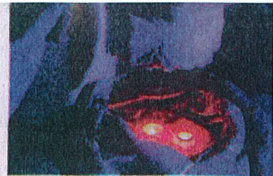
A head-raising prop in the Haunted Lake Lisgar Water Park, and s... with the lights out.